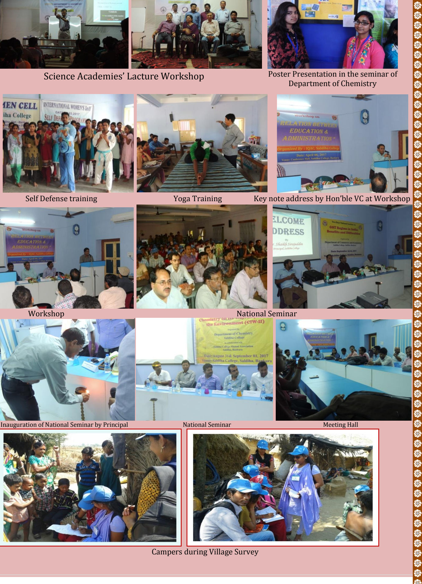
Poster Presentation in the seminar of Department of Chemistry