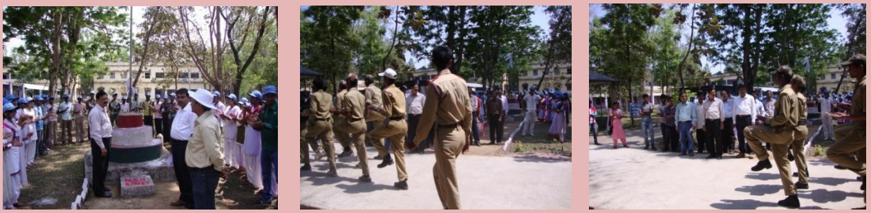
During N.S.S. Flag Hoisting on Inaugural Programme of the Camp with N.C.C. Parade of the College