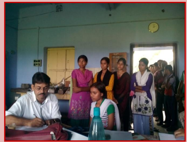
During health check-up of the college students