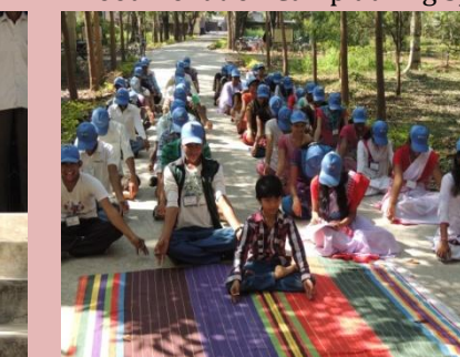
Everyday Yoga and Parade during Camp Period