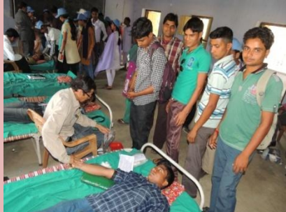
Blood Donation Camp during Special Camp